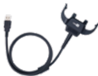
USB snap-on Cable