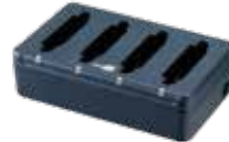
4-slot Battery Charger