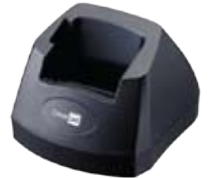
Charging and Communication Cradle