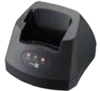
Modem Cradle Ethernet Cradle