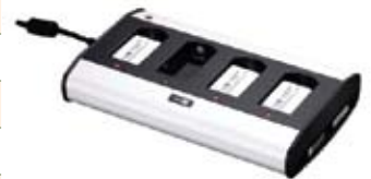
4-slot Battery Charger

©2010 CipherLab Co., Ltd. All specifications are subject to change without notice. All rights reserved. All brand, product and service, and trademark names are the property of their registered owners.